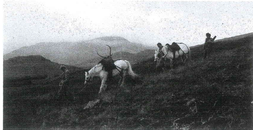
A time before Argocats: stalking at Ardverikie, which cost £75.60 a week in 1959

IT was the era of split-cane fishing rods and silk lines, ponies were the sole means of taking a stag off the hill, and a day's driven grouse-shooting cost only £85 per gun. This year, CKD Galbraith, specialist sporting agent with a range of estates across Scotland and Ireland, celebrates its 50th anniversary. To commemorate the event, it has released a special brochure for 2010, which covers the history of the firm and changes in sporting trends since 1959. Among the statistics is the revelation that a week at Inverpattack Lodge, Ardverikie, cost £75.60 per week in 1959, but, today, with 15 stags, it will set you back more than £7,000 for the same period, and that those who wished to try something a little more exotic in the 1950s could try wild-goat stalking—for a mere £54 per day. To order a brochure, telephone 01738 451600 or visit www.sportinglets.co.uk SG